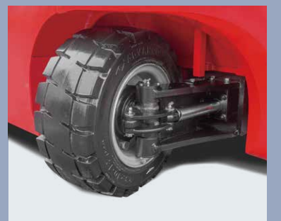
Smaller turning radius