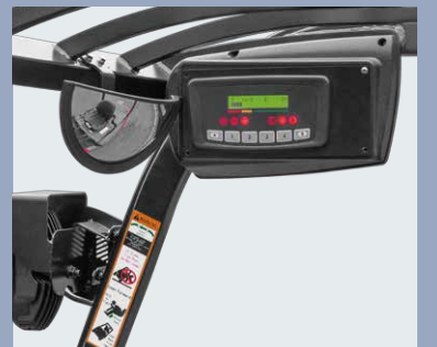
Easy to see display