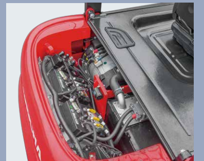
Easy for maintenance